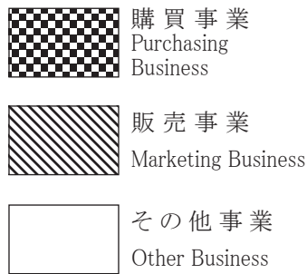
漁 協 (沿海地区漁協のみ Coastal District) Fisheries Coops —平成30年度— Business Year,2018 (12,649)